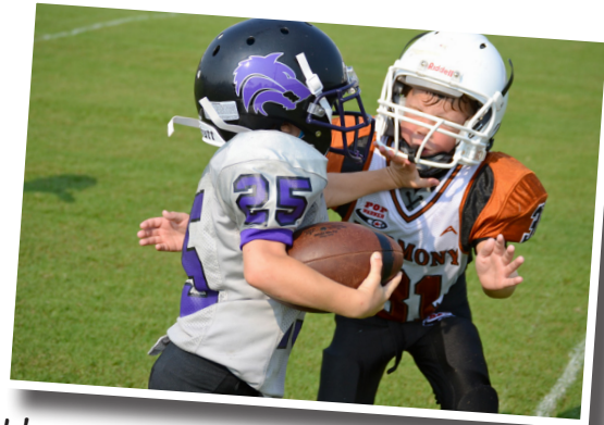
Happiness is playing football!