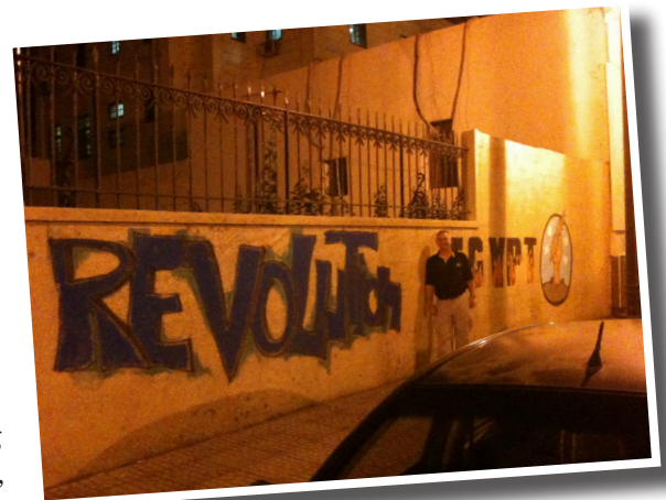
Rich in Cairo in May after the "Arab Spring" revolution.